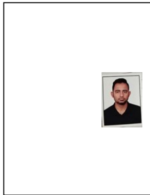
Too Small X