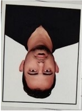
Inverse Photo X