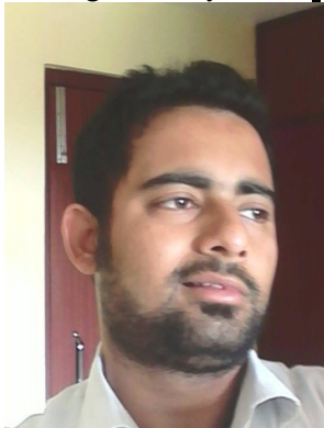
Facing Sideways X