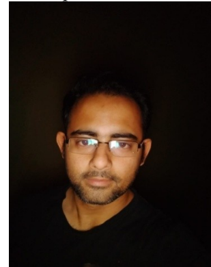
with Spectacles X