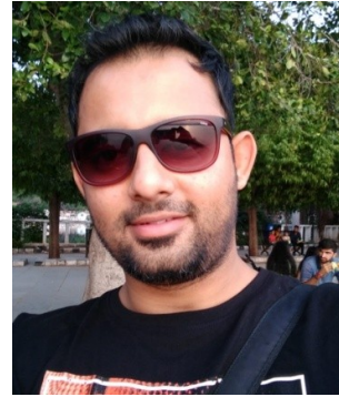
With Googles X