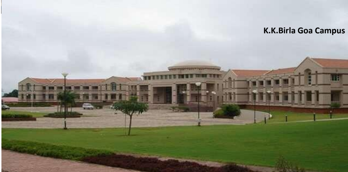
K.K.Birla Goa Campus