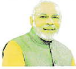
Shri Narendra Modi Hon'ble Prime Minister of India